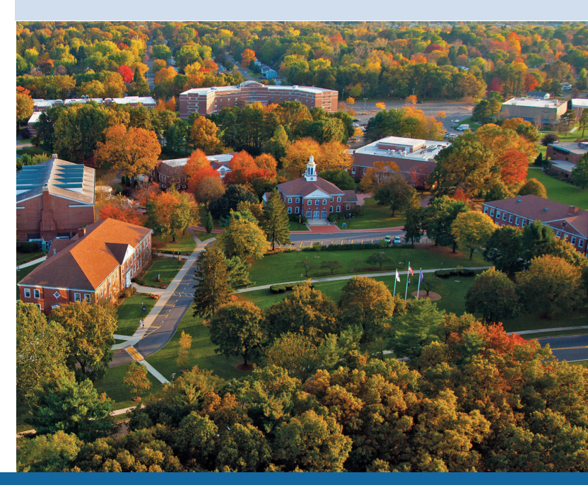
Visit wne.edu/IIm for more information.

Students have access to a wealth of primary and secondary materials online, including Westlaw, LexisNexis, CCH publications, Warren Gorham Lamont treatises, the entire BNA Tax Management Portfolio series, and RIA Checkpoint Online.