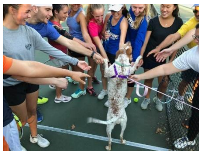
("Root for Rescues" pictured above)

Each section of the application is evaluated using the scale above.